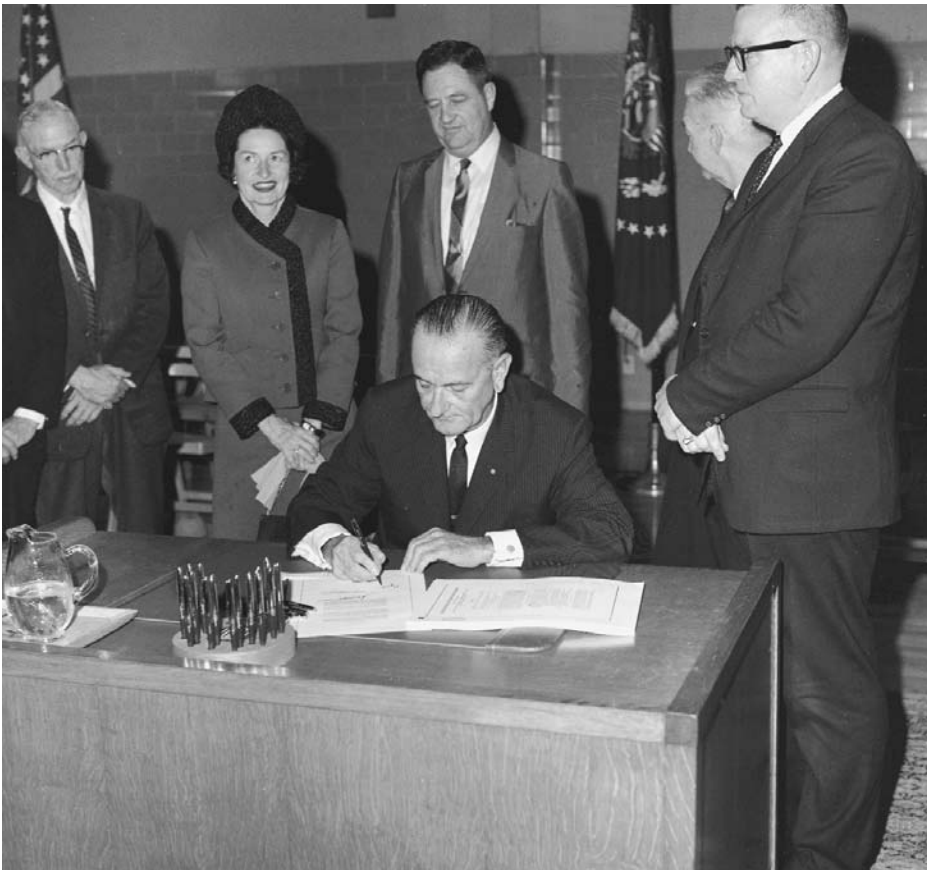
President Lyndon B. Johnson signs the Higher Education Act of 1965.

programs. A program for high school students called “Upward Bound” was one of the first demonstration programs to be developed. Its purpose was to identify secondary school students from low-income backgrounds who were underachieving, and to motivate and prepare them to pursue postsecondary education. Seventeen pilot projects began operation in the summer of 1965 serving 2,061 students. 6