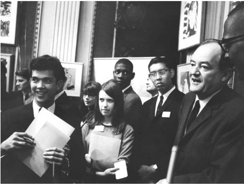
Vice President Hubert Humphrey (far right) meeting with Upward Bound students.

This was the first time this particular population of students had been recognized for special consideration in an education law.